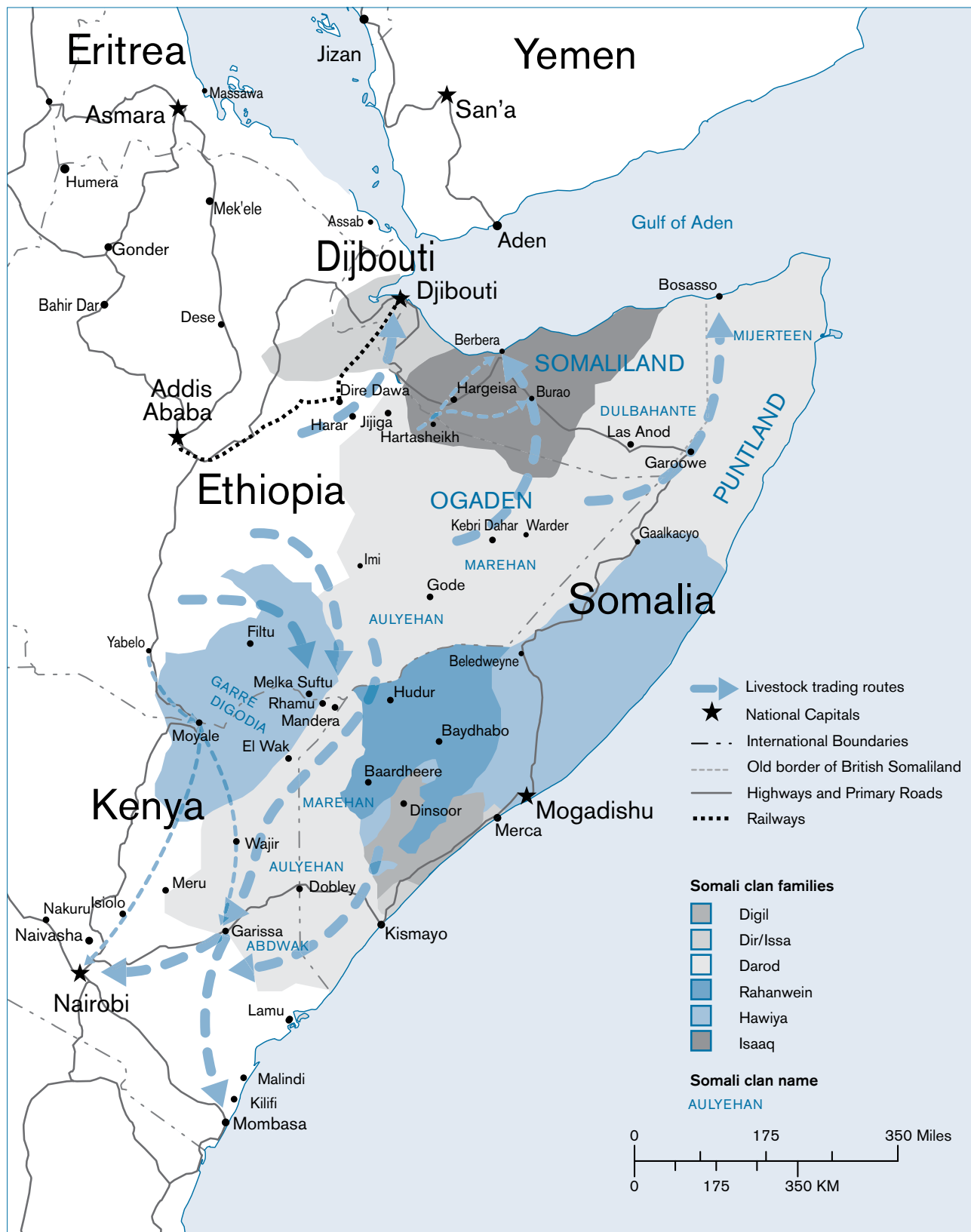
Map 1: Livestock trade routes on the Kenya–Somalia–Ethiopia borderlands

Source: Based on Food Security Assessment Unit/United Nations Development Programme map of livestock trading routes from the Atlas of Somalia , UN 2004, and United Nations Office for Coordination of Humanitarian Affairs/Data and Information Management Unit map of the Horn of Africa, 2007. The boundaries and names shown and designations used on this map do not imply endorsement or acceptance by the author or Chatham House.